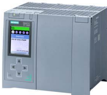
Figure 1 - Simatic S7-1500 illustration

The TOE is managed with TIA Portal V14 // WinCC V14.